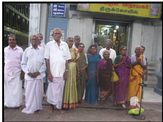
Elders visit Manakular vinayar Temple at Pondy.