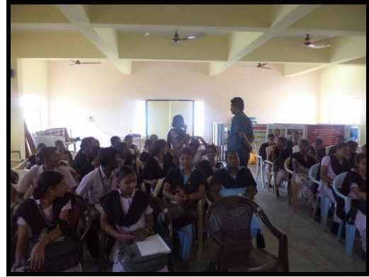
E.M College of Nursing student visit at TEV