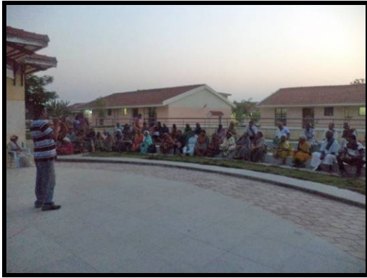
Tamil Nadu Institute Palliative care Nursing Student visit at TEV.