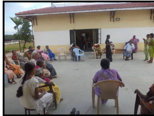
MSW Student conducted elders small games.