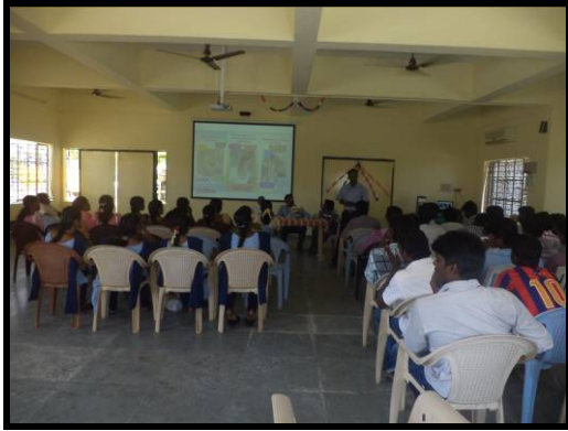
Jayaram Engineering College student visit at TEV