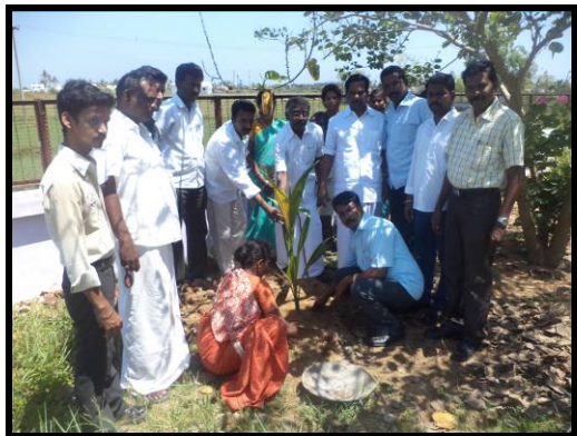
A sapline was planted by our Ex.MLA